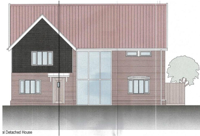
al Detached House