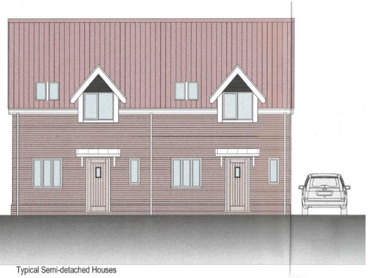
Typical Semi-detached Houses